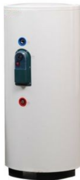
Solar pressurized water tank